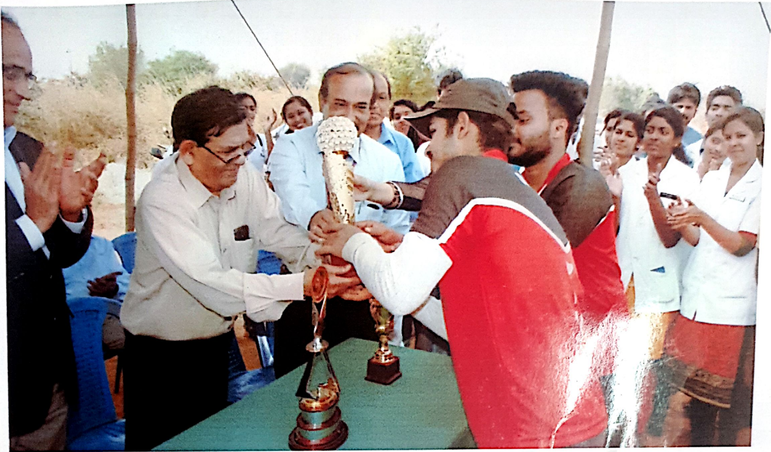
“Captain of yellow rangers receiving the runner’s trophy 2015-16 from our honorable chancellor”